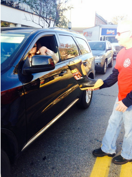
Birmingham Local 911