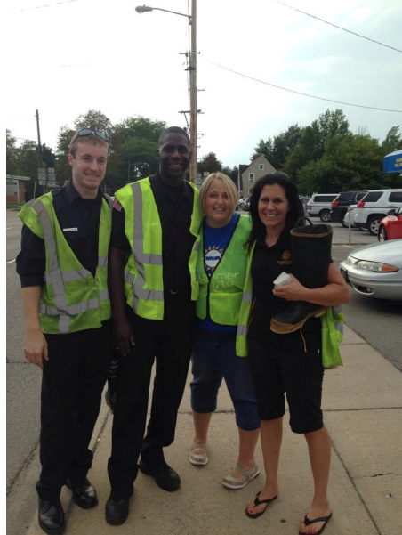
Saginaw Local 102