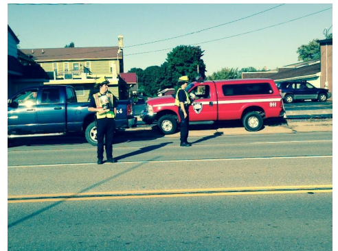
Manistee Local 645