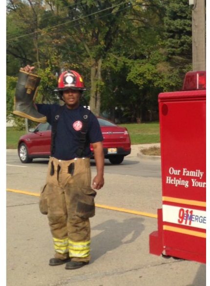
Sterling Heights Local 1557