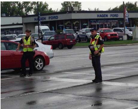
Bangor Twp Local 1682