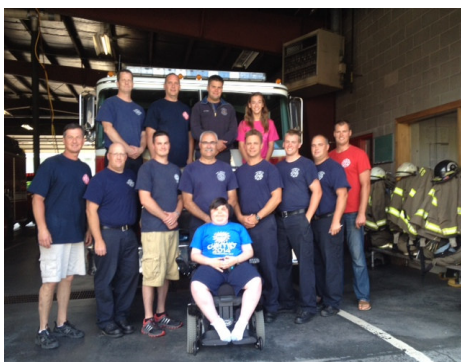
Marquette Local 643