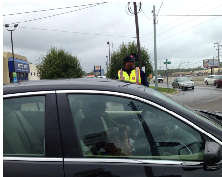
Flint Local 352