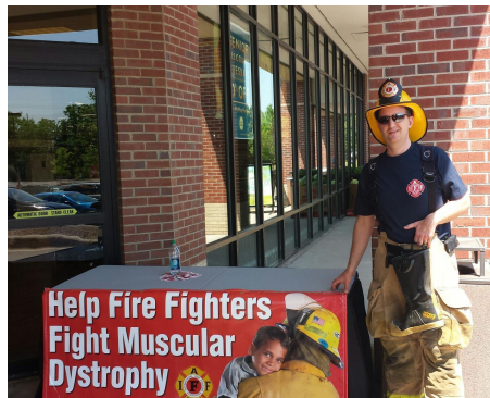
Plymouth Local 4146