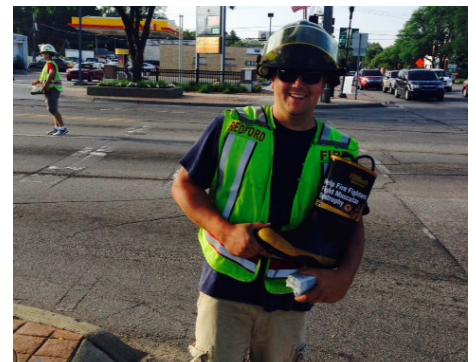
Redford Local 1206