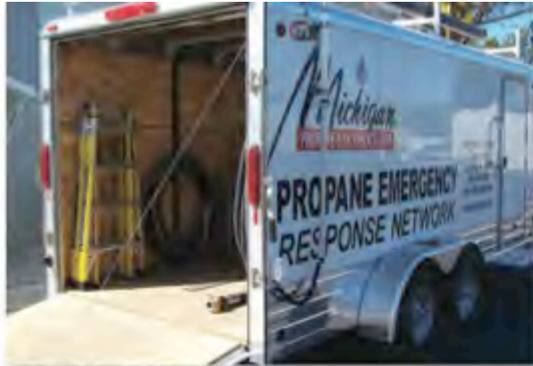
New PERN Trailer